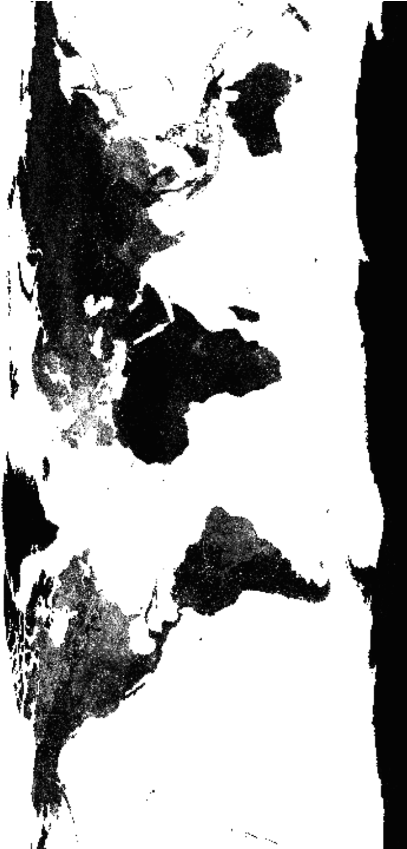
Figure 1: Infrastructural complexity across the world